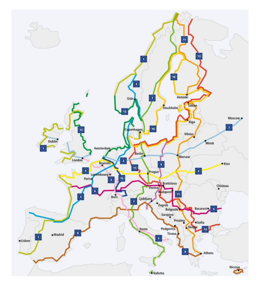
Euro-velo Network. (European Cyclists' Federation 2013)

Re: Transport and tourism, we would stress Ireland's strengths as a potentially top class cycle tourism destination. This can be developed with fairly modest investments in a high quality cycling routes and, in particular, in the EuroVelo cycling routes: EV#1 Atlantic Route and EV#2 Capitals Route.