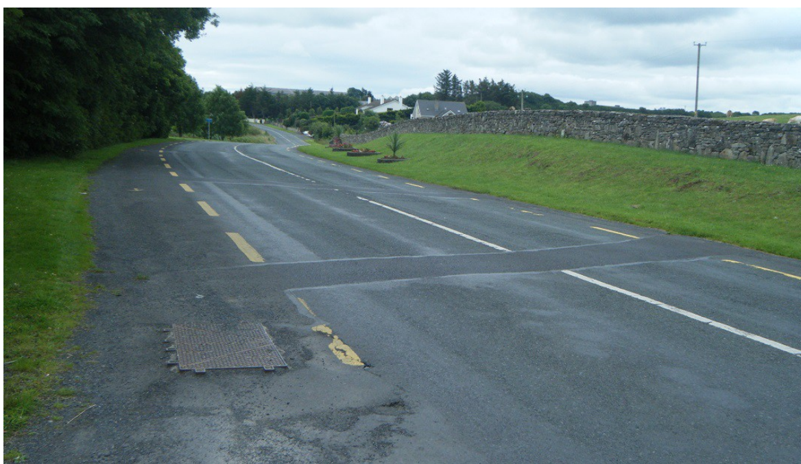
Figure 2 – The need for a signallised crossing of the main road into Killala