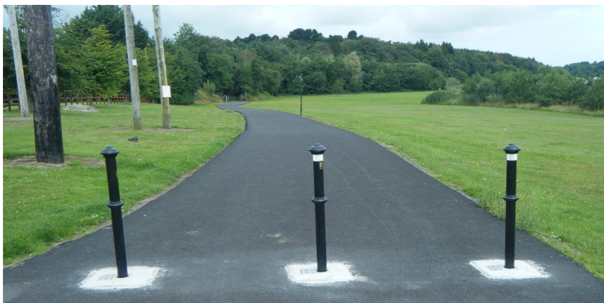
Figure 3 – High quality surfacing at facility just south of Belleek forest

The quality of the resurfaced part of the route just south of the forest in Belleek is excellent – Figure 3 below.