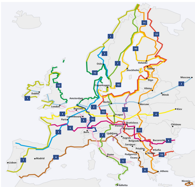
Figure 2 – Euro-velo Network. Euro-velo Route #1 “Atlantic Coast” runs from Scandinavia to the Algarve via Northern Ireland [8]

To this list we would add political commitment.